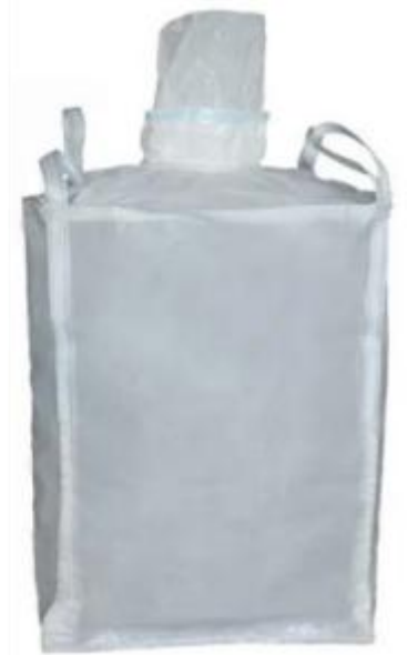
Side seam fabric