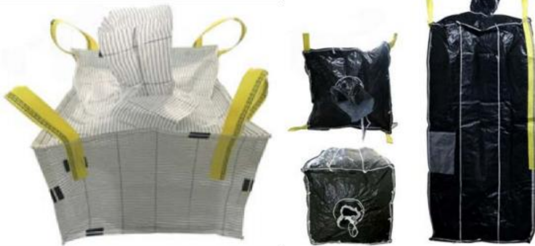
Conductive FIBC bags