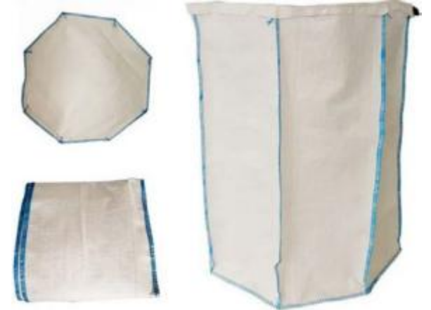
Heavy Duty FIBC