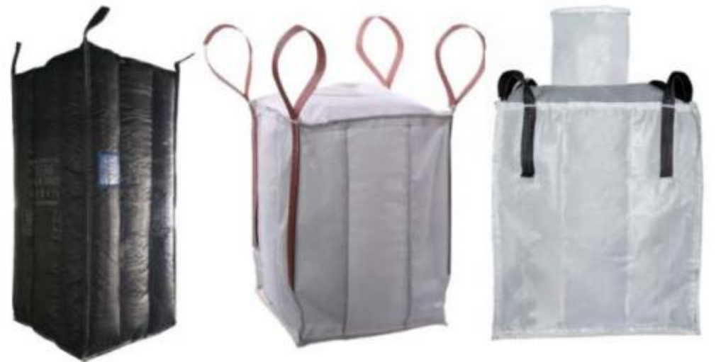
FIBC with Baffles