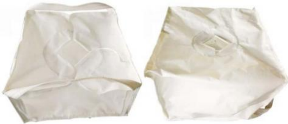
Advantages of material opening design, easy loading and unloading