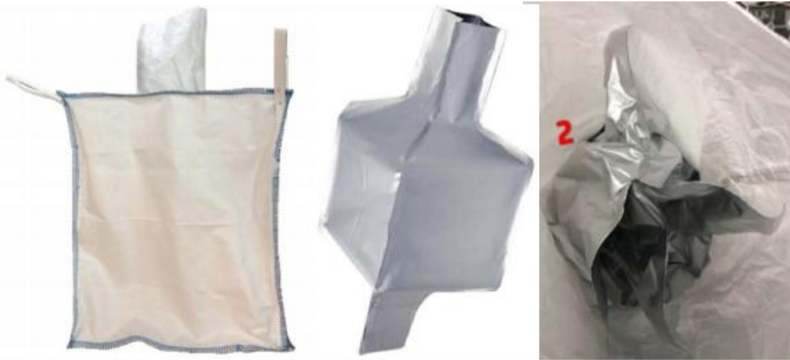
UV resistant outer & aluminum foil liner