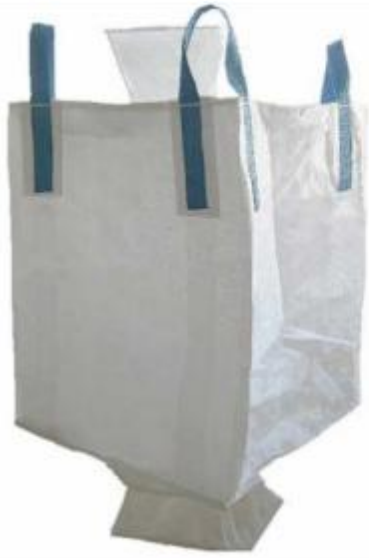
Top spout, bottom spout