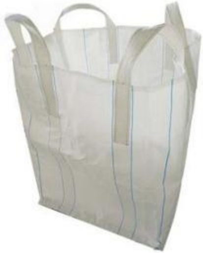
Open top, flat bottom