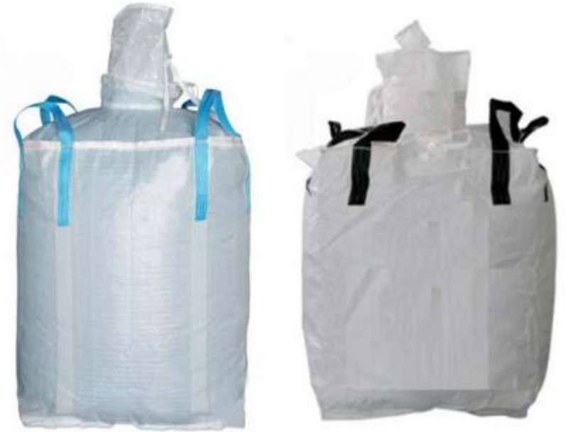
Anti-static FIBC bags